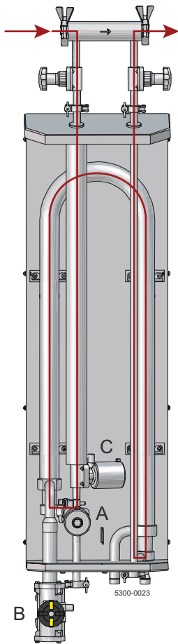
Figure 1. Stand-by mode

The velocity in the main line must be >1.0 m/s in order to achieve a turbulent flow during stand-by mode.